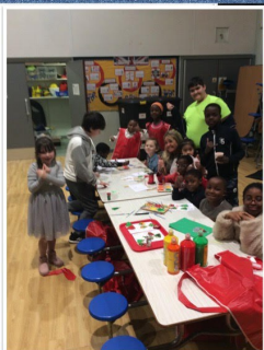
Making Christmas decorations in afterschool club.

Friday 26th January- year 5 Author visit